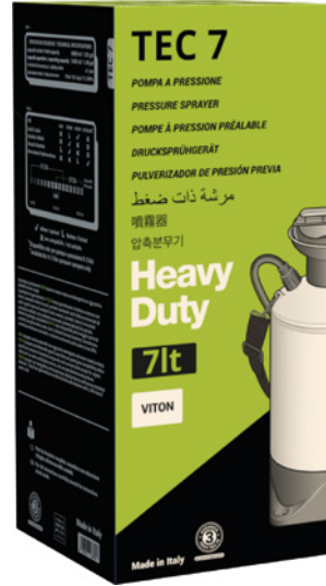
NBR TEC 7 VITON DIMENSIONS (cm) 19,5 x 19,5 x 46,5