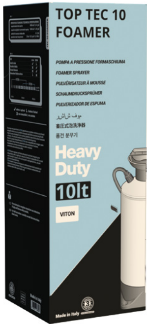
EPDM TOP TEC 10 FOAMER VITON DIMENSIONS (cm) 19,5 x 19,5 x 56,5