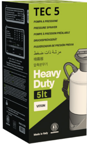
NBR TEC 5 EPDM DIMENSIONS (cm) VITON 19,5 x 19,5 x 41,5