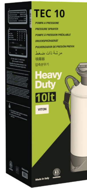
NBR TEC 10 EPDM DIMENSIONS (cm) VITON 19,5 x 19,5 x 56,5